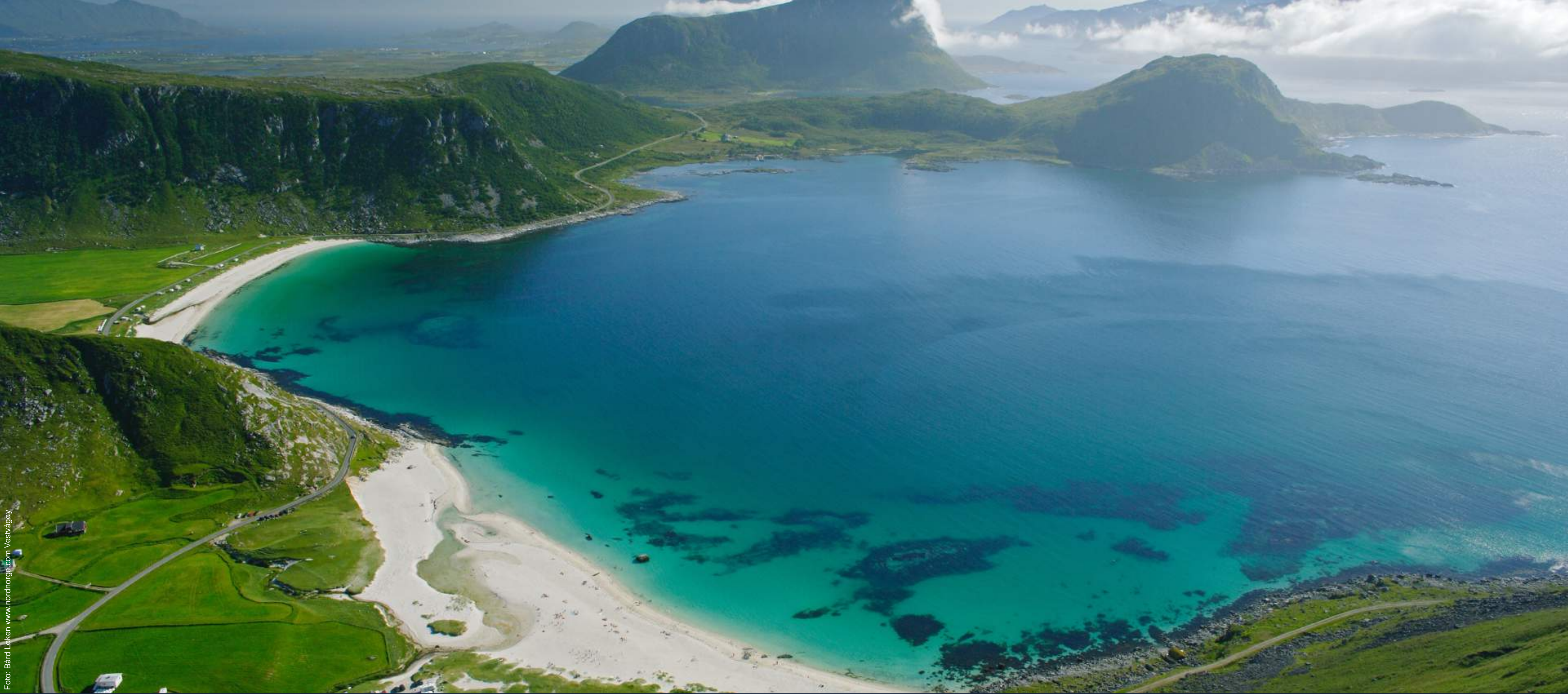
Vestvågøy