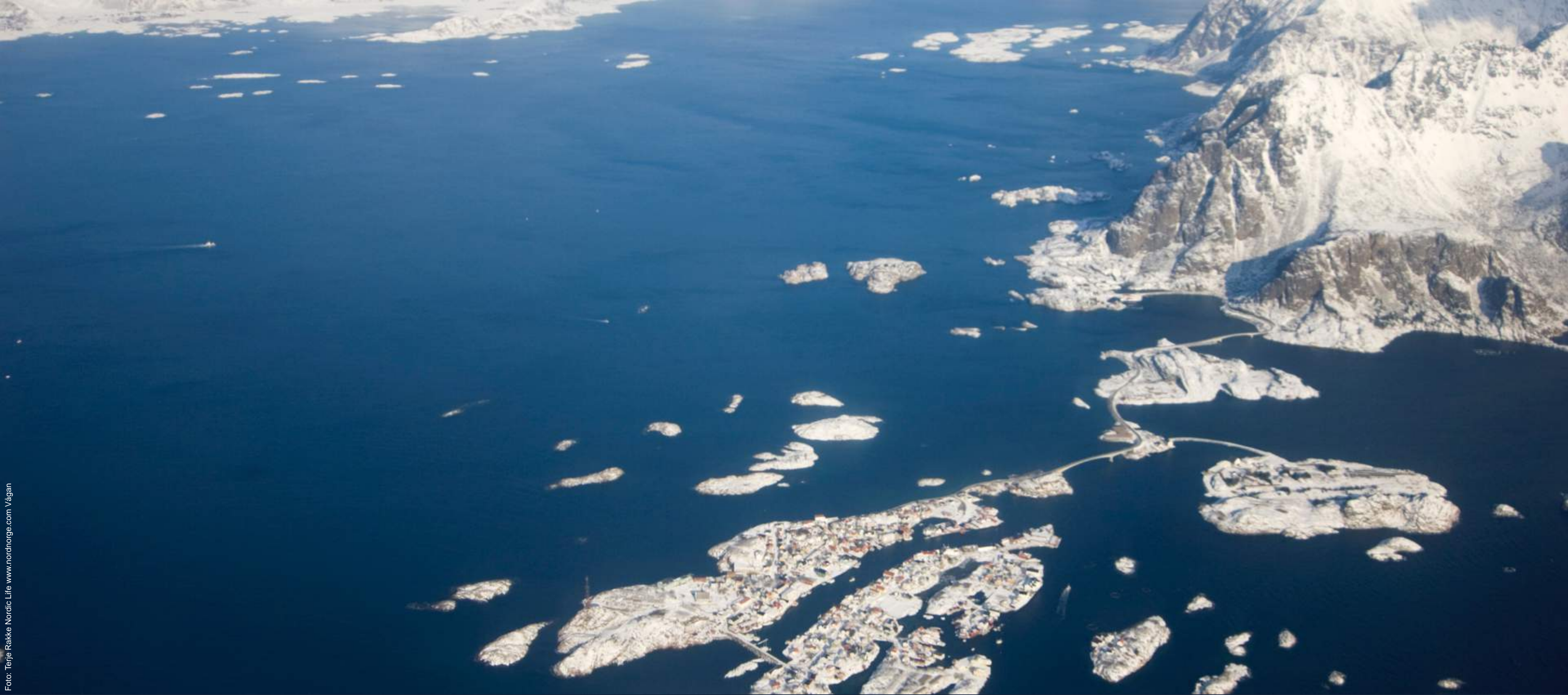
Vågan