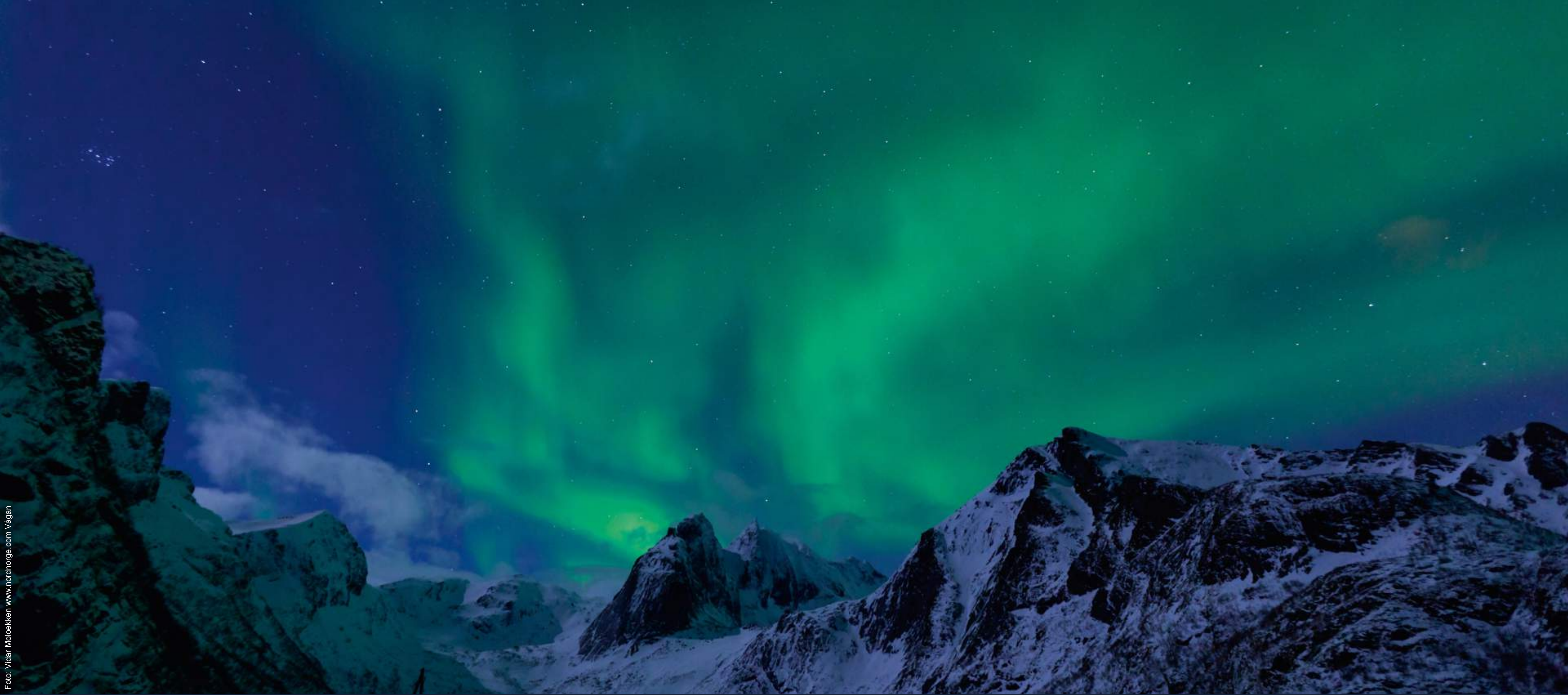
Vågan